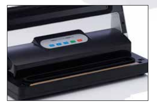
Wide Seal Wider seal strip provides air-free sealing for a stronger seal.